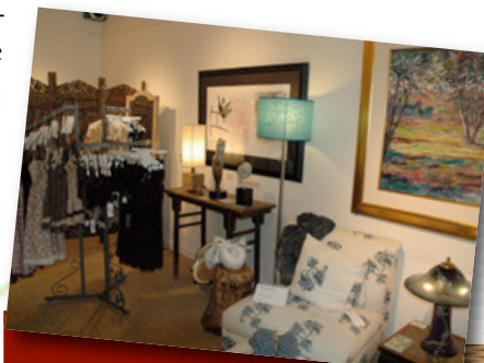
Around the Corner Too, located in the Arcade features mostly clothing, lingerie, jewelry and art