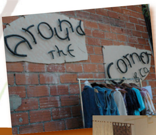
Around the Corner & Co. features located on S. Montgomery features mostly furniture, upholstery, bedspreads, clothing and art